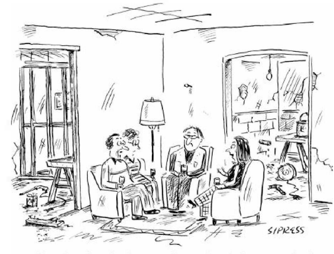
"Our dream is to live long enough to see the end of our renovation."

Supposedly, most of the rest of the work in the bathroom will happen swiftly next week. Our contractor swears this is true. Hmmm. We will see.